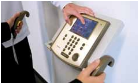
▲ Body composition analysis

Please contact us for an extremely competitive quote on a Wellness Check Service for your business or if you would like to know more about the benefits this can have.